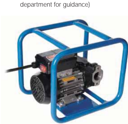
Panther in frame