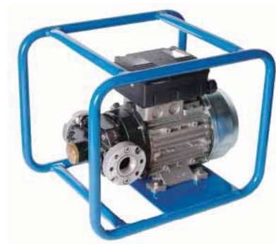
E120 in frame